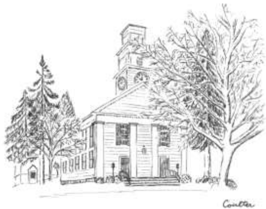
SCANTIC MEETING HOUSE – BUILT 1802

Presorted Std. U. S. Postage PAID East Windsor Connecticut Non-Profit Permit No. 20